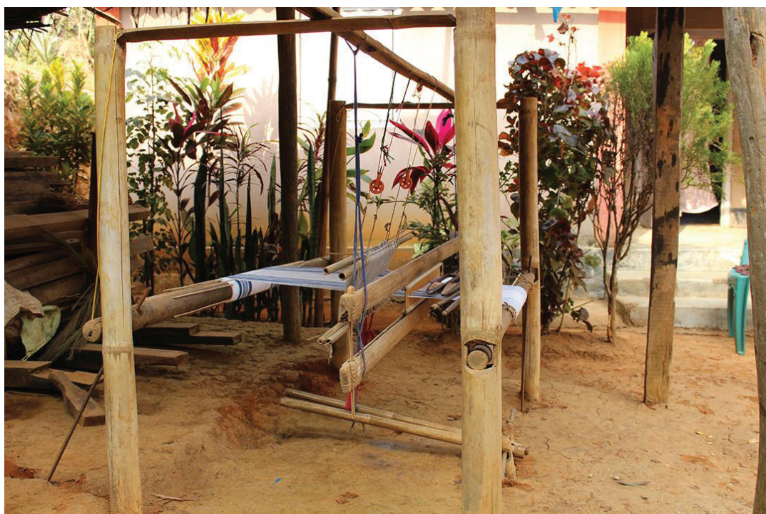
Figure 7: The thain ra of the Karbis of Plasha, a modified frame loom with shorter depth.