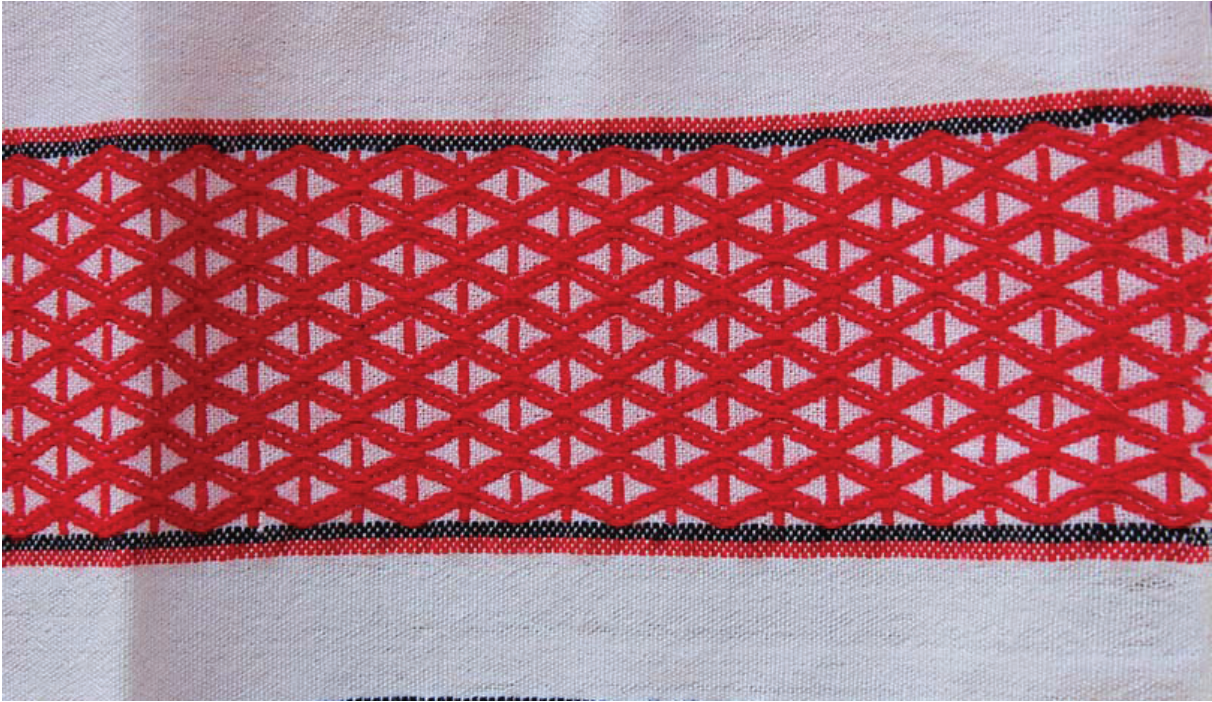
Figure 25: Khmat Lewi