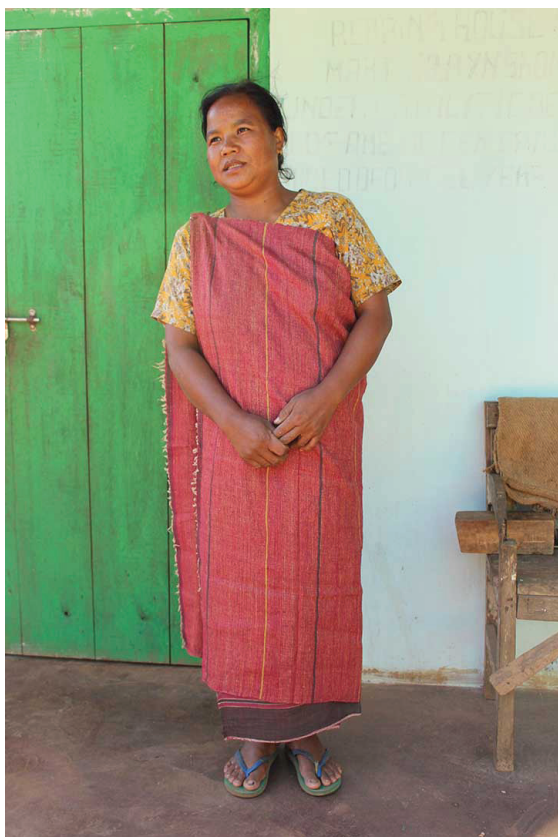
Figure 12: The Khasi Bhoi chappang cloth in eri silk