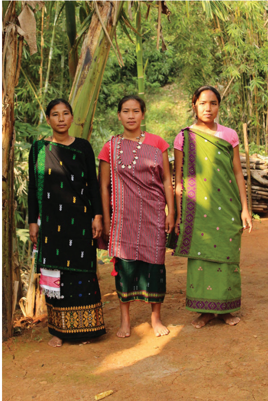
Figure 16: The Karbi style of dress of the pekok and paning/pini