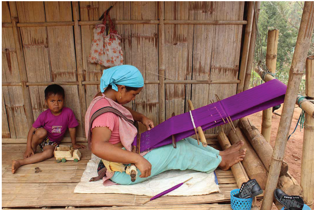
Figure 6: The backstrap loom of the Karbis

Karbi artisans both of the hilly areas in Karbi Anglong and the Assamese plains typically weave on a backstrap loom (figure 6). However many Karbis in the Ri Bhoi District use the backstrap loom or a modified version of the frame loom, known as the thain ra . Figure 8 illustrates the primitive set-up of this loom, while figure 7 illustrates a contemporary thain ra . Interestingly some Karbis in Plasha also use the floor loom, perhaps having learnt the technique from their Khasi Bhoi neighbours.