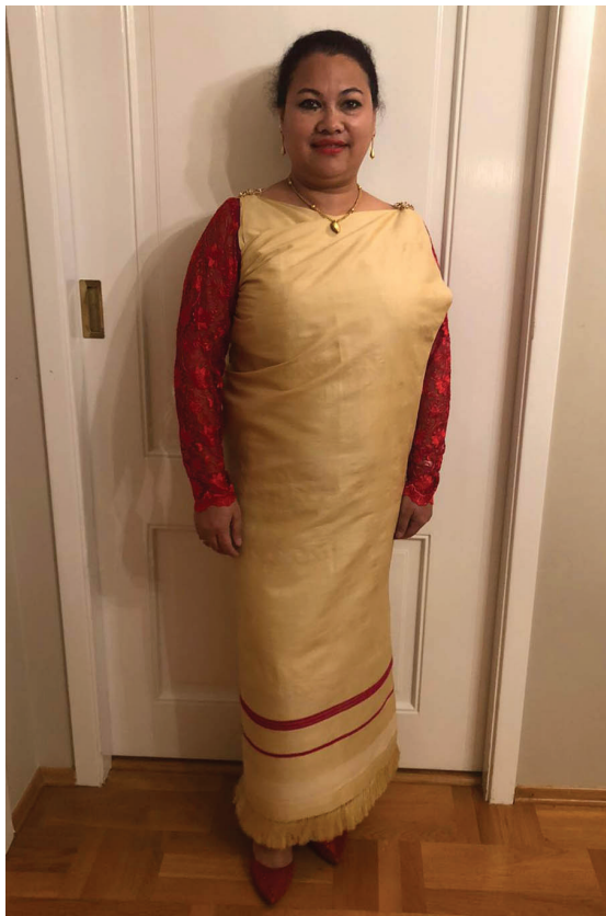
Figure 10: The Khasi Dharra in pat silk (mulberry silk)