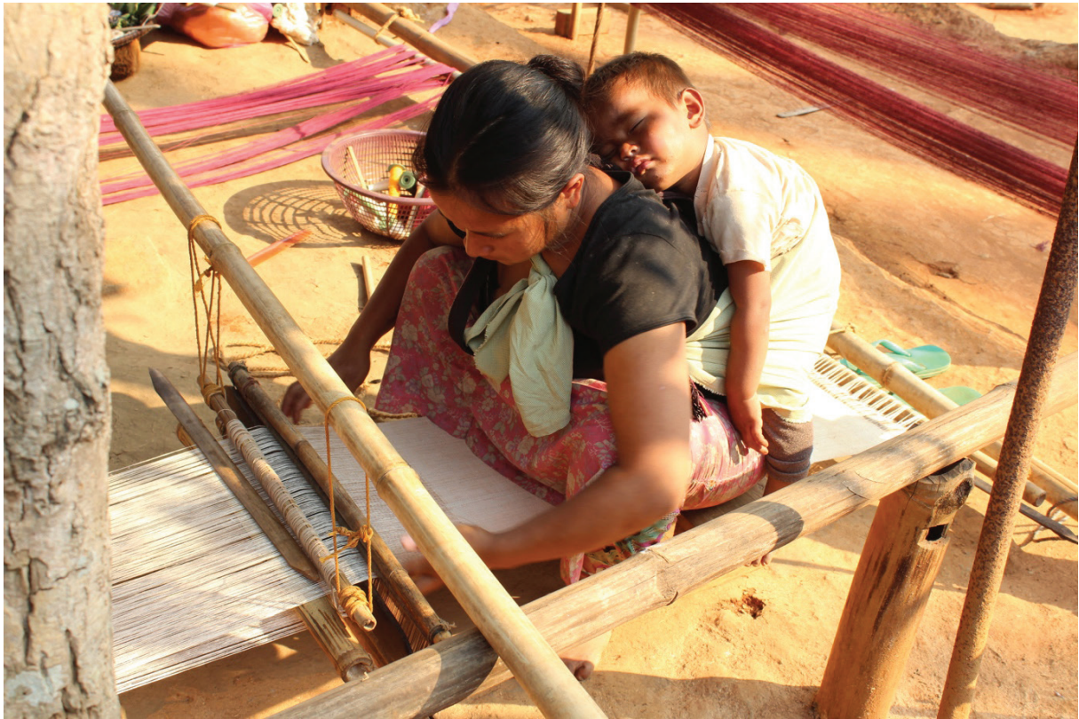
Figure 4: The floor loom (thain madan)