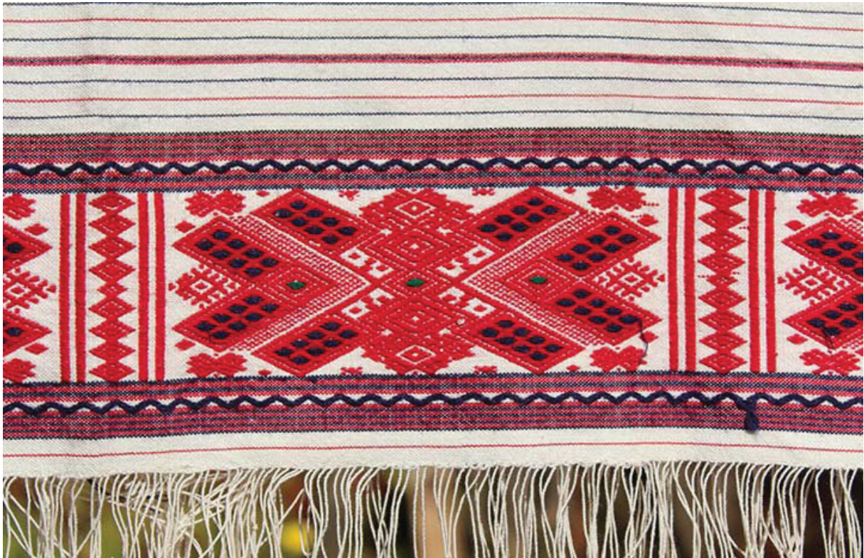
Figure 21: Khmat Lyngdoh