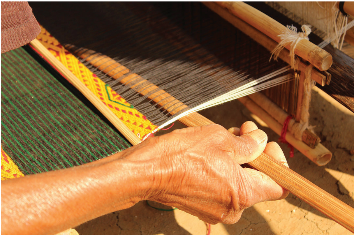
Figure 9: Picking the supplementary weft design with a smooth wooden sword.