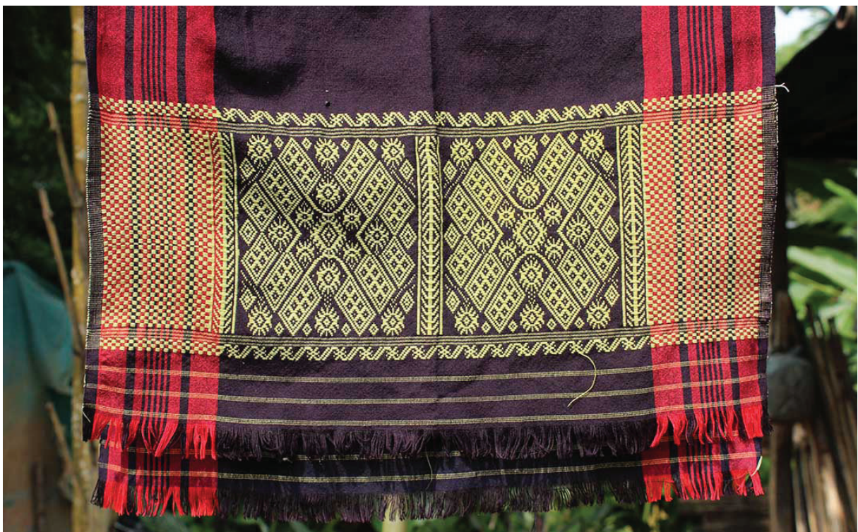
Figure 24: A contemporary Karbi supplementary weft design with similar elements to Khmat Dkhar

of design name itself also indicates a proximity to Assam, since the word dulong is used for bridge, rather than the Khasi word jingkieng .