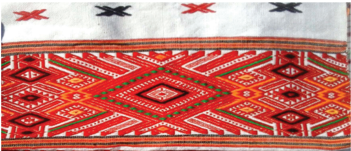
Figure 22: Khmat Dulong Byrnie

Khmat Lyngdoh is a design that represents one of the most important figures in the community- the Lyngdoh (priest) who performs the rites and rituals of the indigenous Khasi religion. Note the vertical line of nine diamonds separating the motif repeats, in keeping with the Khasi belief of protection against the devil with the number nine and three.