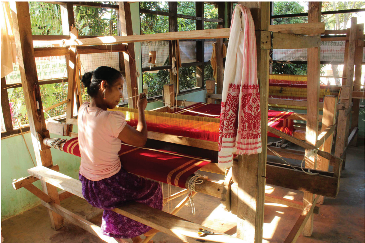
Figure 5: The frame loom (thain kor)