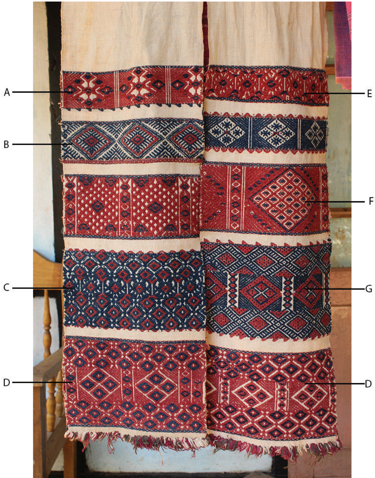
Figure 20: The heirloom Khasi Bhoi thoh pan in handspun and naturally dyed eri silk