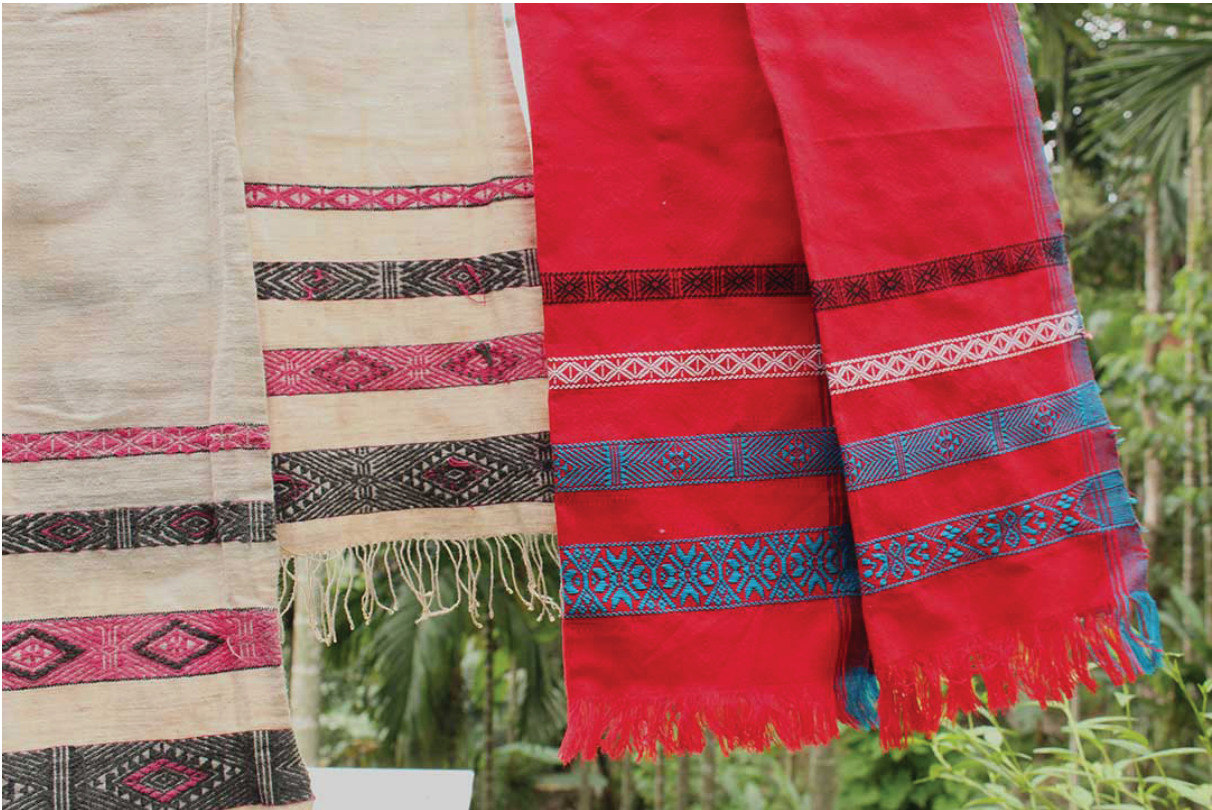
Figure 26: Supplementary weft designs of the Karbi community, note the small geometry similar to Khmat Lewi.