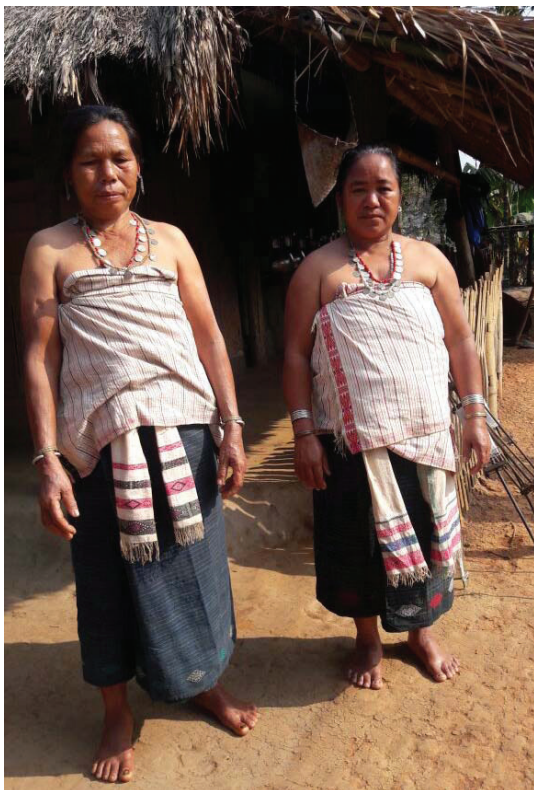
Figure 18: The style of dress worn by previous generations of Ri Bhoi Karbis. Nowadays, they will wear a blouse or the pekok and paning as in figure 16.