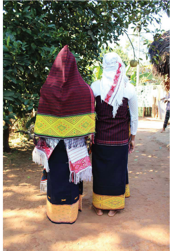
Figures 14 and 15: The Khat-ar Lyngdoh dancers dress and ceremonial dress, woven in cotton and acrylic

District, where the climate is significantly warmer and more conducive to cultivation of the silkworms than the highland areas of Meghalaya.