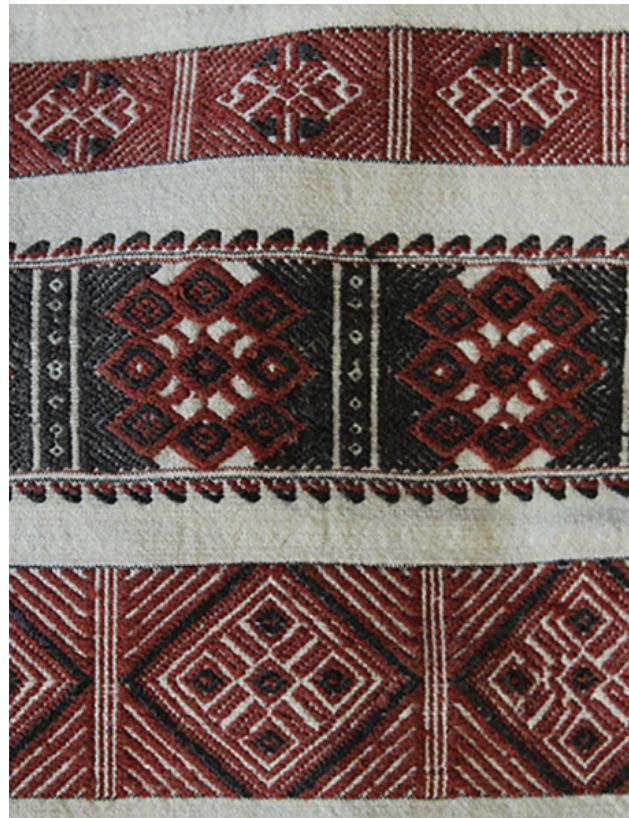
Figure 31: Geometric motifs of the Khasi Bhoi, the middle design bearing resemblance to the green design in figure 30.