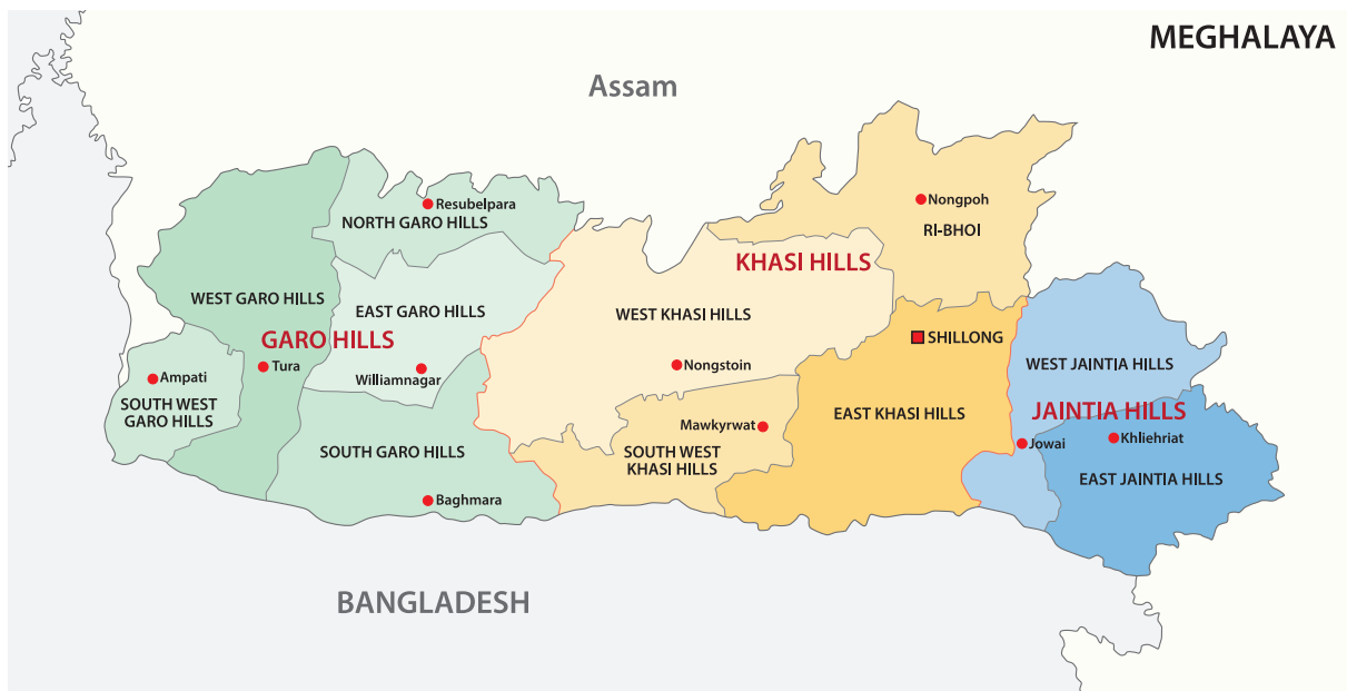
Figure 1: Districts of Meghalaya.

is taking place between communities. The semantics of the name itself, “Ri Bhoi” is the first indication of this cultural melting pot. Originating in the Karew language - the original name and language of the indigenous people of the Ri Bhoi District, the word Bhoi translates as outsiders and the word Ri means land . The outsiders in this context are the Karbi (also known as Mikir ) people, the Tiwa ( Lalu ), Bodo - essentially the non-native tribals, and the Assamese and the Nepalis who have migrated from neighbouring Assam or beyond. The name Khasi Bhoi , a subtribe of the Khasi family thus reflects centuries of interaction with the outsider tribes, as a term to indicate differentiation from the Khasi people of the uplands of the East and West Khasi Hills. Many Khasi Bhoi communities today continue to identify themselves as Karew , but accept that the wider Khasi communities know them as Bhoi , or Khasi Bhoi .