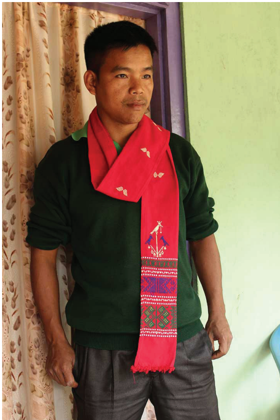
Figure 30: Figurative and geometric motifs of the Karbis