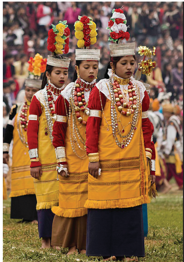
Figure 11: The Khasi dancer's dress at the Ka Shad Nongkrem festival