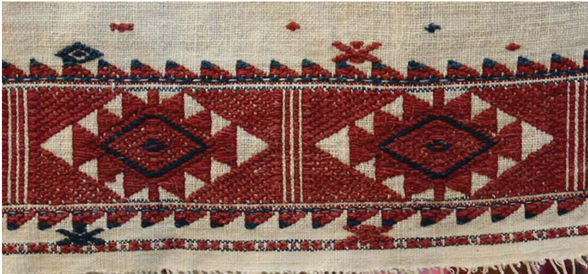
Figure 29: Supplementary weft motifs from the Khasi Bhoi textiles