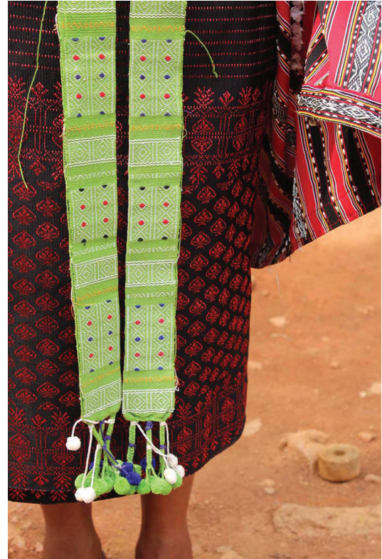
Figure 17: The ringkok/vamkok belt with geometric motifs