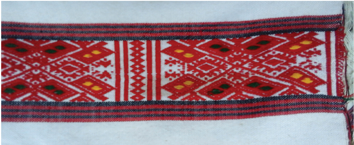
Figure 23: Khmat Dkhar