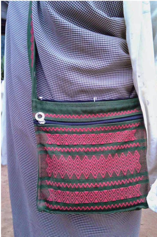
Figure 3: The pla kieng sling bag of Raid Nongthlulh.

An interesting item has evolved through the recent availability of acrylic yarn. The sling bag known locally as pla kieng (figure 3) is used for every woman's essential items - her purse, her mobile phone and her kwai (betel nut)! The bags are woven on the floor loom (figure 4), which is able to achieve the thick and robust structure required for bags and the result is a durable, cost-effective bag. It is so widely used that one can argue has now become tradition of the Ri Bhoi District. The quote below from Kong Nianda, an artisan of Mawlong village, illustrates the notion of identity of place over identity of ethnicity through the use of this bag.