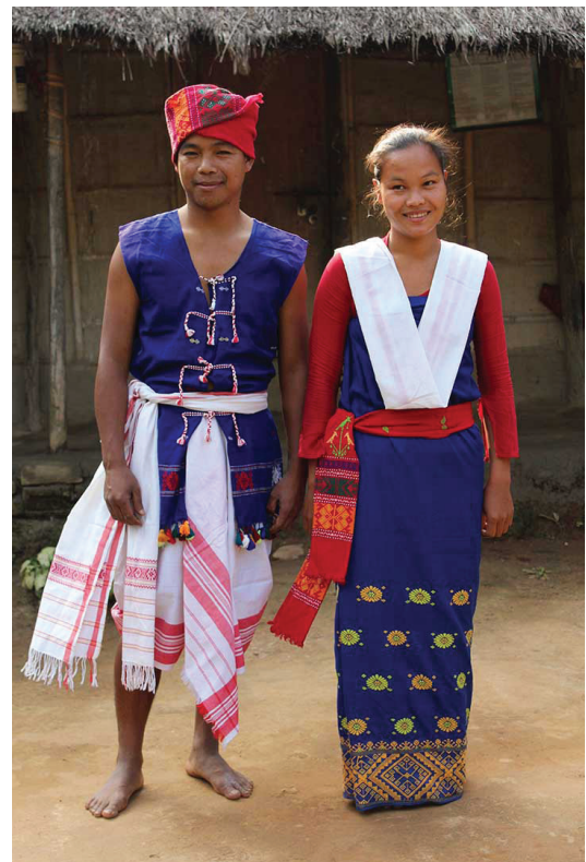
Figure 19: The dancers dress, typical of Assamese Karbi dress