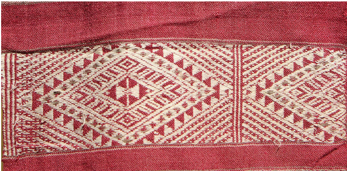
Figure 28: Supplementary weft motifs from the Khat-ar Lyngdoh textiles