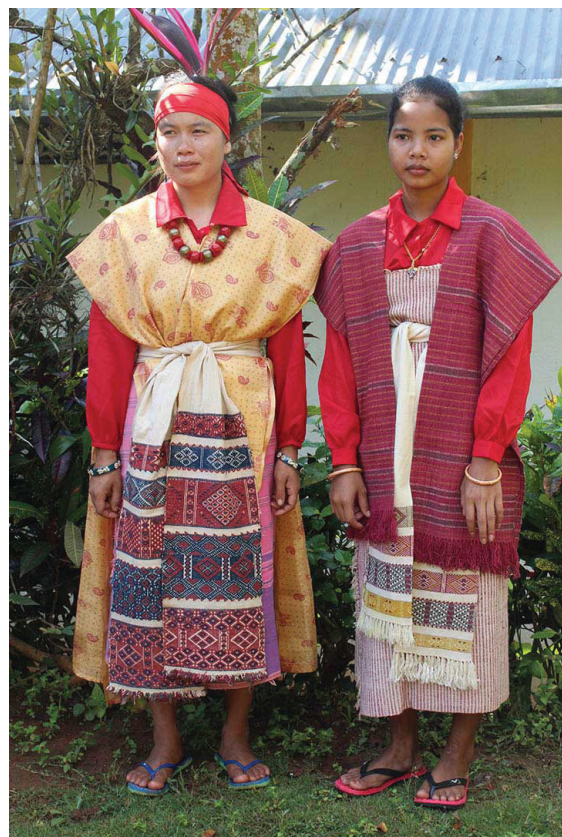
Figure 13: The Khasi Bhoi dancer's dress and ceremonial dress, including many items in eri silk