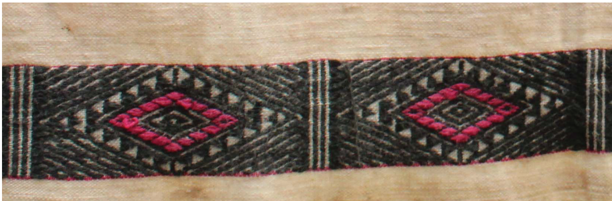
Figure 27: Supplementary weft motifs from the Karbi textiles

The following three figures are all interpretations of the diamond khmat or ‘eye’ design present in Karbi textiles (figure 27), Khat-ar Lyngdoh textiles (figure 28) and Khasi Bhoi (figure 29). These three examples are all artisan heirloom pieces in handspun cotton or eri silk, and naturally dyed. The fluid use of motif in these examples highlights the impossibility of defining a distinct line between cultures, between textile heritage of neighbouring communities. The assimilation of culture, or design aesthetic is so organic, gradual and natural amongst creative communities that it does not even seem necessary to define from where it originated.